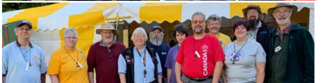
This year YBMT, Maytland and Brampton have combined under one marquee, and are offering paracord crafts Saturday afternoon.